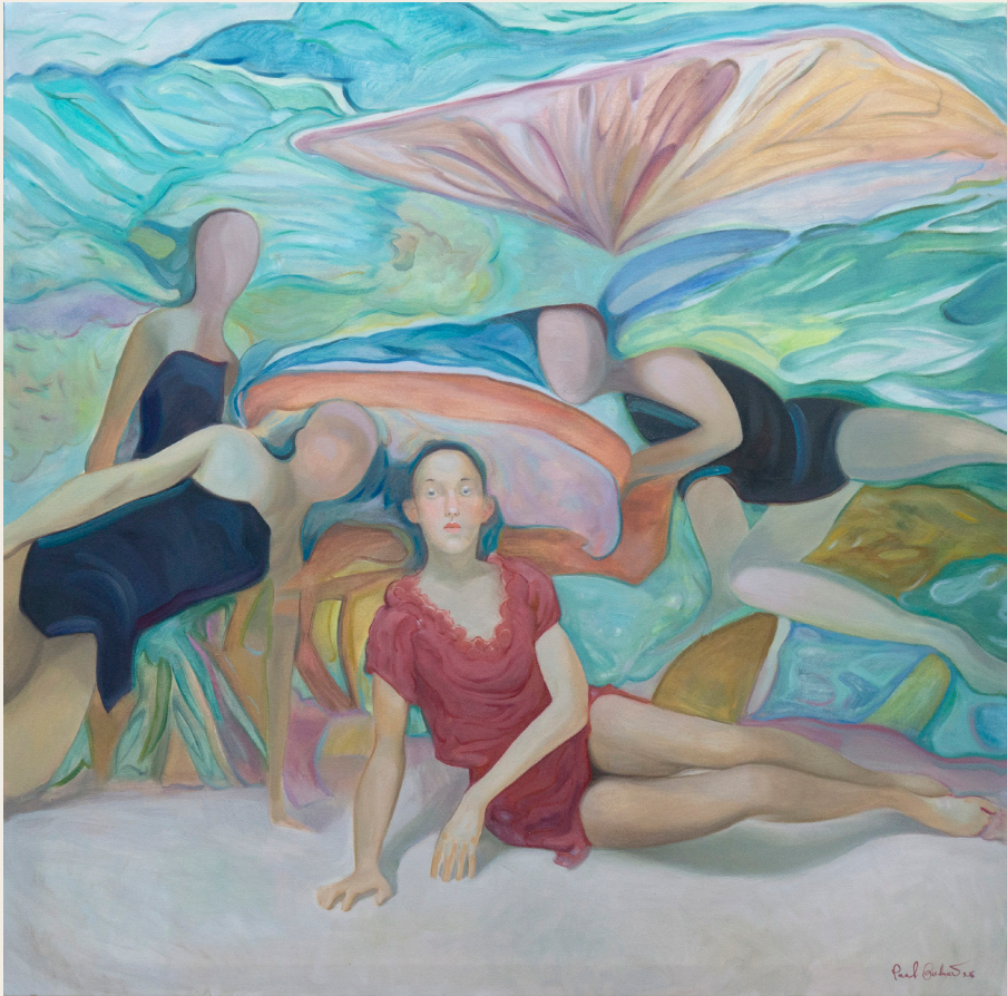
Drugarice / Friends

Nevidljivo preplitanje orbita po kojima se kreću usamljeni univerzumi. Proučavanje gravitacije srca, suptilne umetnosti dodira i tišine ispunjene elektricitetom uzajamnog prisustva u beskrajnom kosmosu ljudskih susreta / An invisible intertwining of orbits along which lonely universes move. A study of the heart's gravity, the subtle art of touch, and a silence filled with the electricity of mutual presence in the endless cosmos of human encounters.