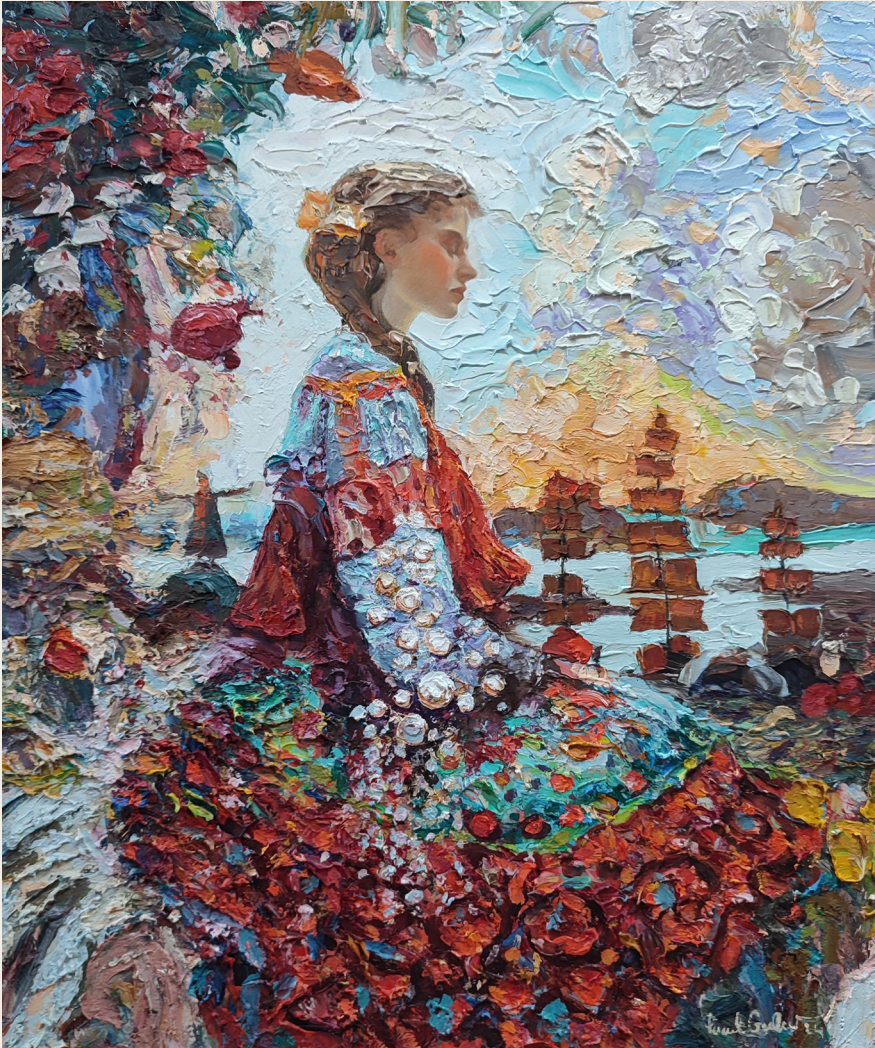
Rastanak / Parting ulje na platnu / oil on canvas, 60x50 cm, 2024

Misterija / Mystery ulje na platnu / oil on canvas, 29.5x23.50 cm, 2023