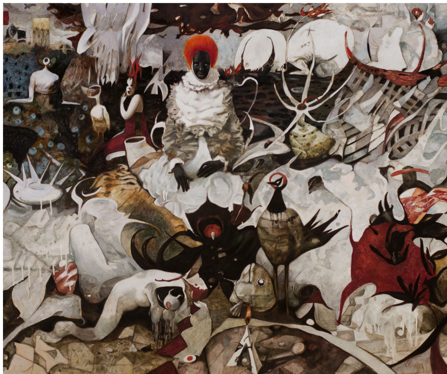
Svesno mirovanje / Conscious inaction ulje na platnu / oil on canvas, 100x120 cm, 2018

Iluzija slobode / Illusion of freedom ulje na platnu / oil on canvas, 100x100 cm, 2018