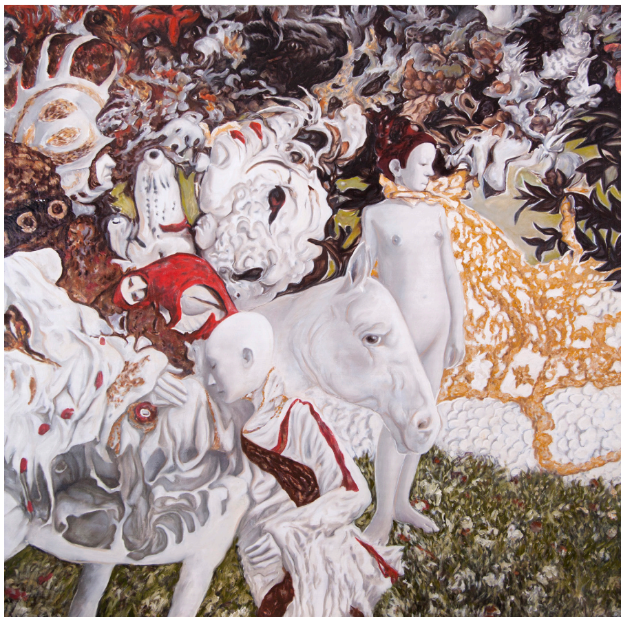
Podvodač / Procurer ulje na platnu / oil on canvas, 100x100 cm, 2014

Odjek zaboravljenih imena koji izbija kroz šapat vremena. Pokušaj da se uhvati treptaj drevnih smislova, gde slike kolektivnog sećanja dobijaju put u sutonu istorije, podsećajući na korene koji sežu u večnost / An echo of forgotten names emerging through the whisper of time. An attempt to capture the flicker of ancient meanings, where images of collective memory take flesh in the twilight of history, reminding us of roots that reach into eternity.