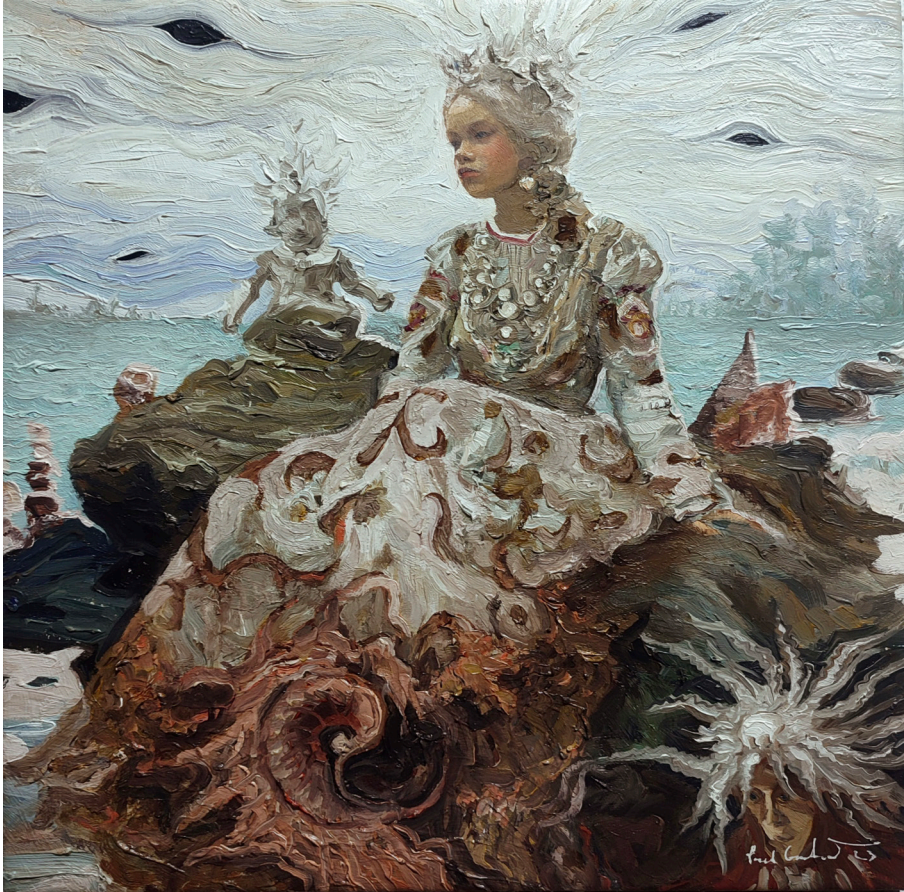
Jezerka devotka / Lake maiden ulje na platnu / oil on canvas, 50 x 50 cm, 2023

Planetarna parada / Planetary parade ulje na platnu / oil on canvas, 50x60 cm, 2023