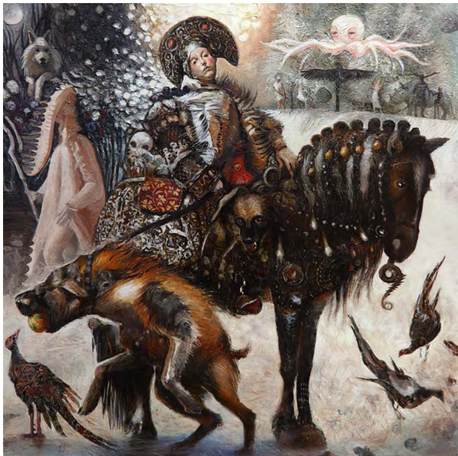
Oprichna princeza / Oprichnaya Princess ulje na platnu / oil on canvas, 100x100 cm, 2022

Divlji lov / Wild Hunt ulje na platnu / oil on canvas, 100x100 cm, 2022