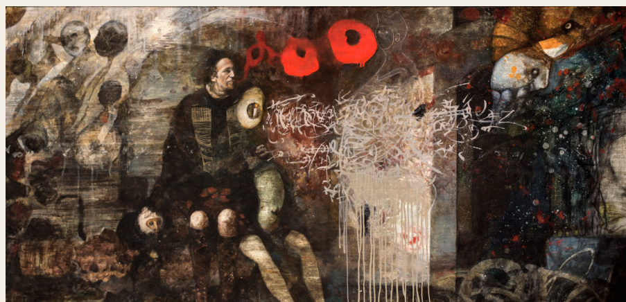
Porodična idila / Family idyl ulje na platnu / oil on canvas, 90x160 cm, 2017