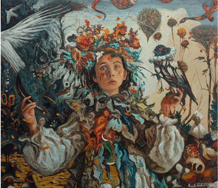
Tvorac / Creator ulje na platnu / oil on canvas, 80x70 cm, 2024

Strpljivo čekanje / Waiting patiently ulje na platnu / oil on canvas, 70x80 cm, 2024