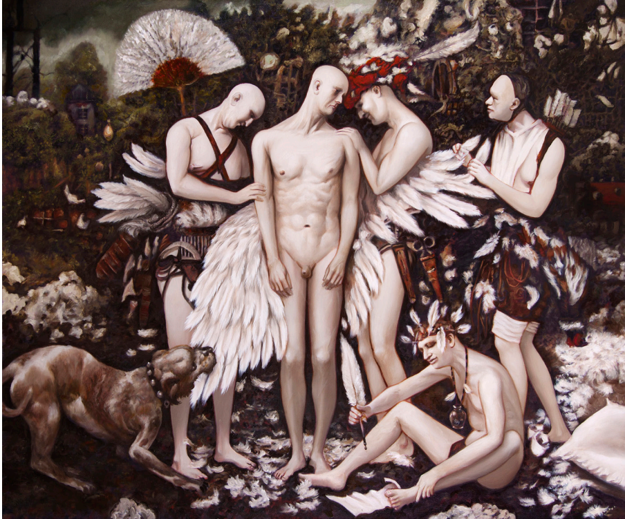
Asimilacija / Assimilation ulje na platnu / oil on canvas, 100x120 cm, 2014

Leto / Summer ulje na platnu / oil on canvas, 80x70 cm, 2014