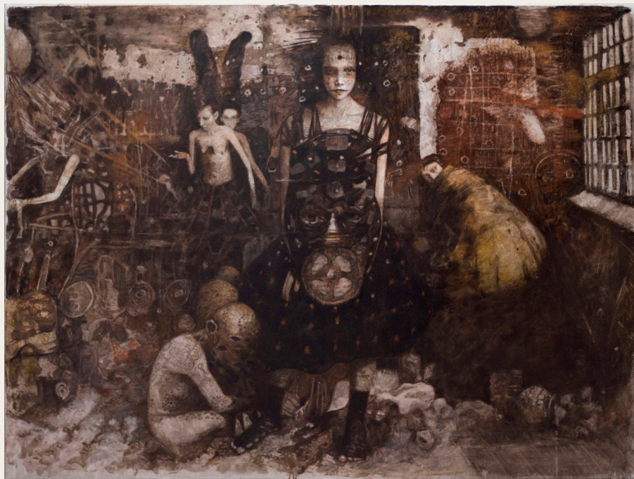
Vlasnica / Proprietress

Odraz u ogledalu nepomične vode, pogled u bezdan sopstvenog „ja“. To su pejzaži unutrašnjeg mira i oluja, zabeleženi u trenutku kada spoljašnja buka utihne, dopuštajući da se čuje čista melodija podsvesti / A reflection in a mirror of still water, a gaze into the abyss of one's own «self.» These are landscapes of inner peace and storms, captured at the moment when external noise fades away, allowing the pure melody of the subconscious to be heard.