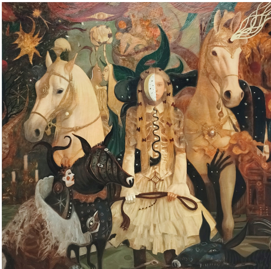
Konjanice / Horsewomen ulje na platnu / oil on canvas, 120x120 cm, 2022

Reka u koju se ne može ući dvaput, trijumf večnog postajanja. Tok formi koje su u neprestanom dijalogu, gde konačno samo najavljuje početak novog, a promenljivost postaje jedina nepromenljiva istina / A river that cannot be entered twice, the triumph of eternal becoming. A flow of forms in constant dialogue, where the final only heralds the beginning of the new, and variability becomes the only unchanging truth.