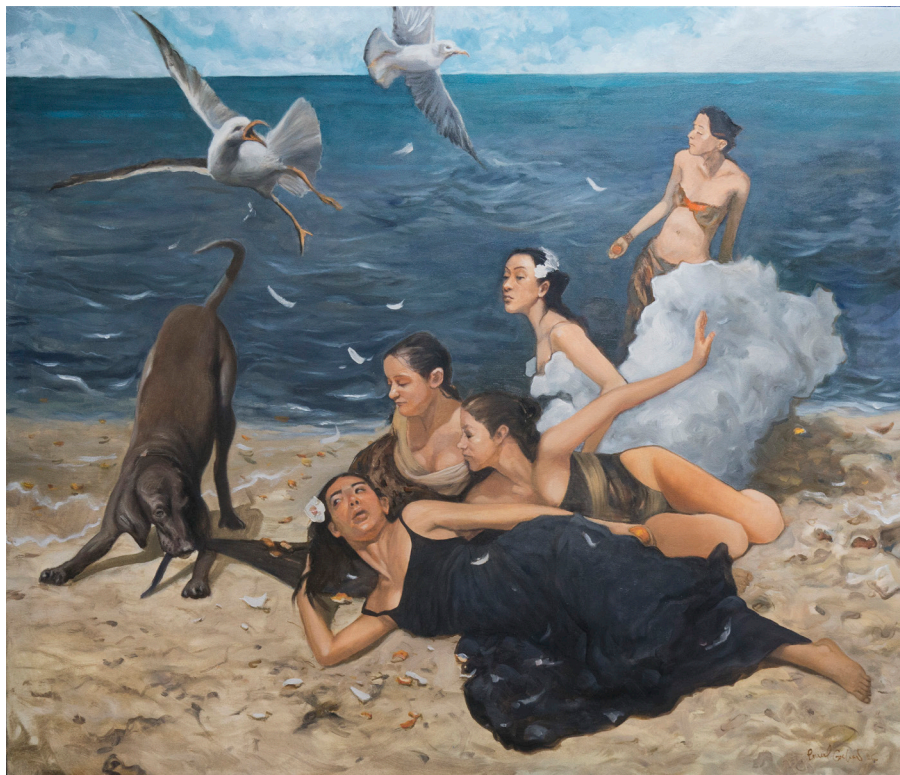
Plaža / Beach ulje na platnu / oil on canvas, 120x100cm, 2026

Suživot / Coexistence ulje na platnu / oil on canvas, 110x110cm, 2026