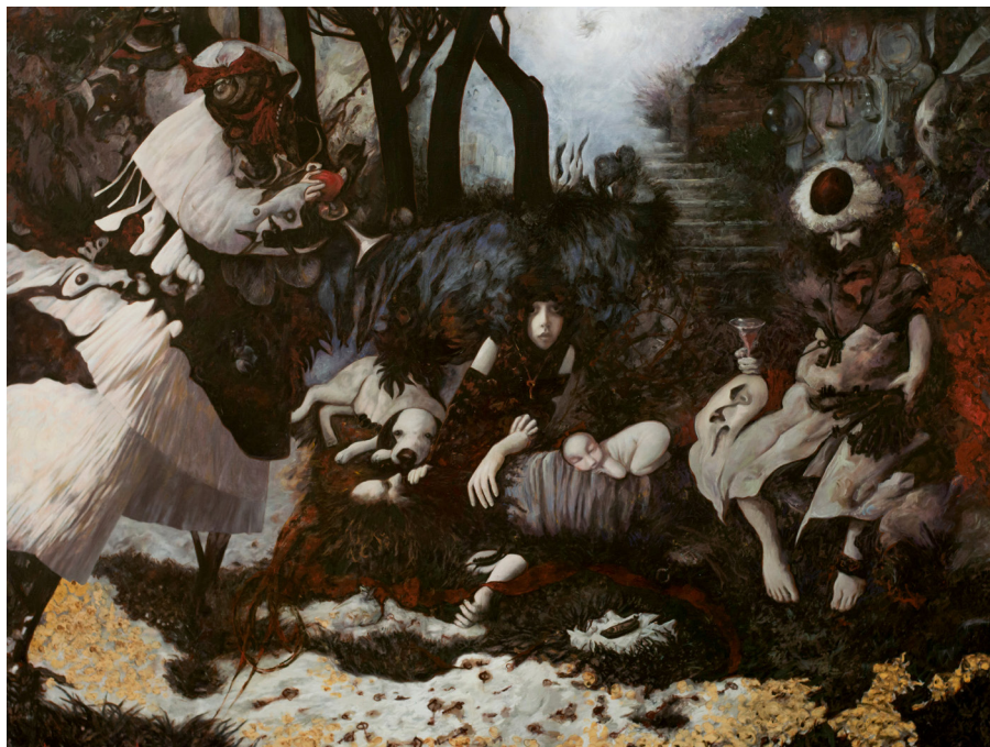
Pijani batler / The drunken Butler ulje na platnu / oil on canvas, 200x150 cm, 2016

Prinošenje žrtve / Oblation ulje na platnu / oil on canvas, 165x200 cm, 2016