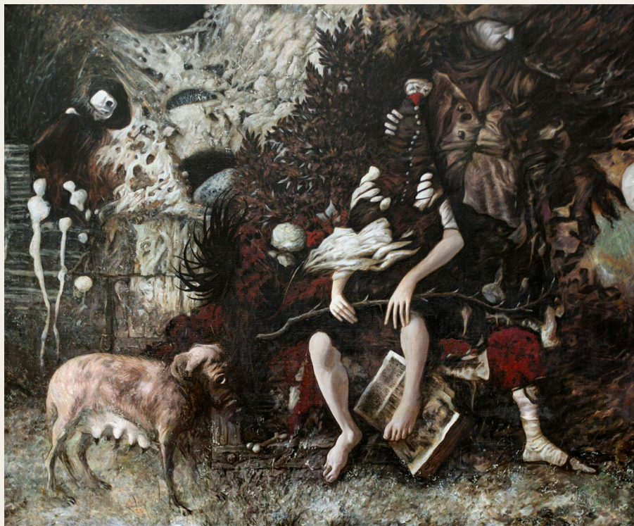
Egzekutor / The Ekzekutor

Teatar nemih stvari, gde uobičajeni predmeti odbacuju maske svoje koristi. Svet se pretvara u tajnopis, gde je istina skrivena između redova vidljivog, a svaka slika je ključ za vrata koja vode izvan očiglednog / A theater of silent things, where common objects cast off the masks of their utility. The world turns into a cypher, where truth is hidden between the lines of the visible, and every image is a key to a door leading beyond the obvious.