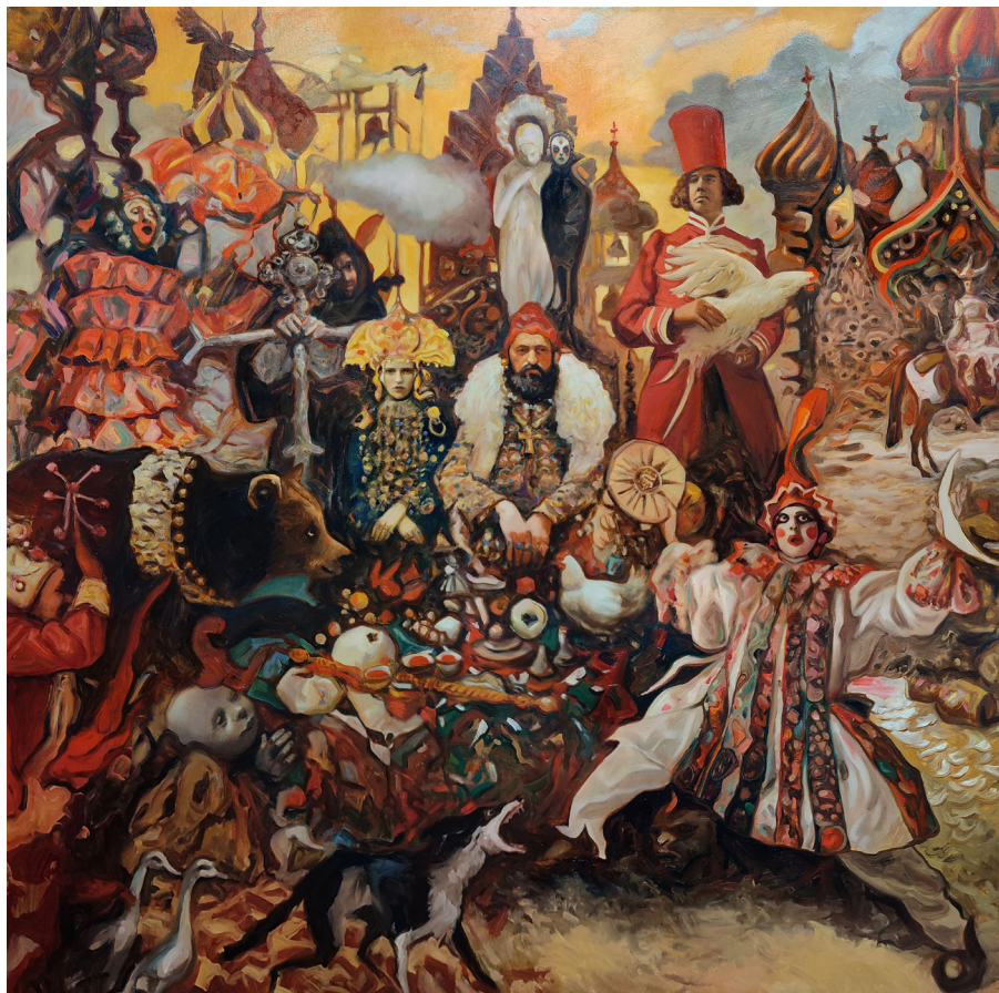
Gozba / Feast ulje na platnu / oil on canvas 120x120 cm, 2025

Monolitna jeka istorije u kojoj su zamrznuti krik i veličanstvenost. Istraživanje sumraka ljudske duše i težine krune, gde kroz grimizne senke prošlosti izbijaju večna pitanja o ceni vlasti i krhkosti života / A monolithic echo of history in which a cry and majesty are frozen. An exploration of the twilight of the human soul and the weight of the crown, where eternal questions about the price of power and the fragility of life emerge through the crimson shadows of the past.