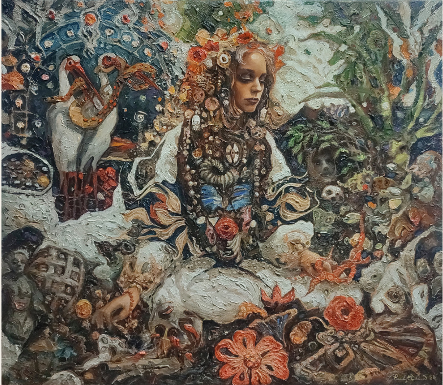
Opomena / Exhortation ulje na platnu / oil on canvas, 80x70 cm, 2024

Priprema za ceremoniju / Preparation for the ceremony ulje na platnu / oil on canvas, 70x80 cm, 2024