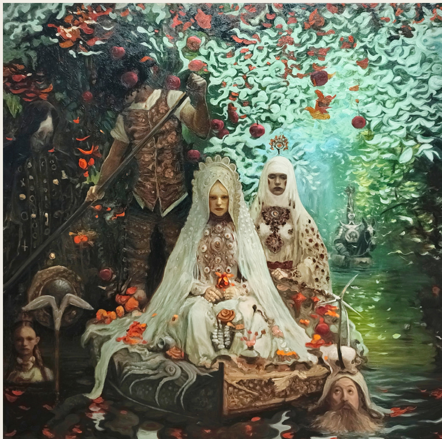
Kraljevska nevesta / The royal bride ulje na platnu / oil on canvas, 120x120 cm, 2023

Neograničena vlast / Unlimited Dominion ulje na platnu / oil on canvas, 120x120 cm, 2023