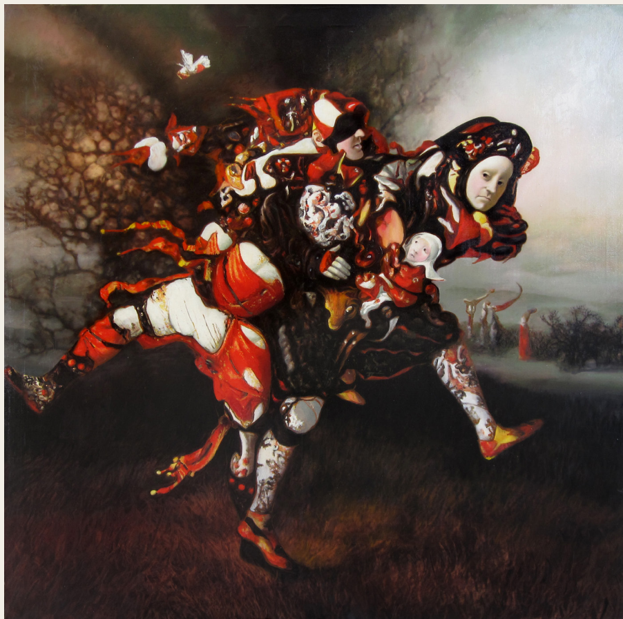
Bekstvo / Escape ulje na platnu / oil on canvas, 100x100 cm, 2013

Saosećanje / Compassion ulje na platnu / oil on canvas, 100x100 cm, 2013