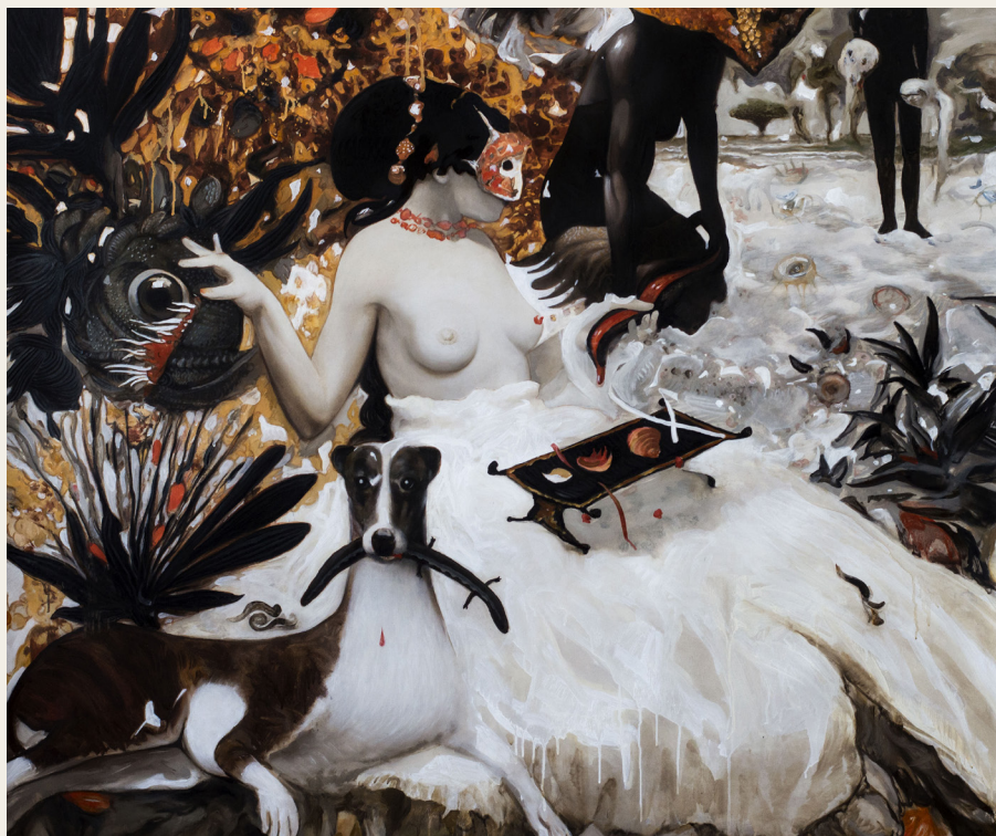
Plodovi mora / Seafood ulje na platnu / oil on canvas, 100x120 cm, 2018

Ples senki na granici stvarnosti i sna. Istraživanje nestalnog prostora gde se istina drobi u hiljade komadića, a mašta dograđuje svetove iz prolaznih odsjaja, dovodeći u pitanje čvrstinu same zemlje pod nogama / A dance of shadows on the border of reality and dream. An exploration of a precarious space where truth shatters into a thousand fragments, and imagination constructs worlds from fleeting glimmers, questioning the very firmness of the ground beneath one's feet.