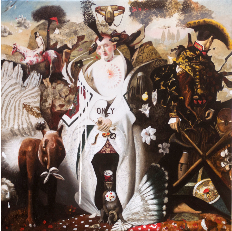
Samo ti / Only you ulje na platnu / oil on canvas, 70x70 cm, 2019

Večni voz / Eternal train ulje na platnu / oil on canvas, 100x100 cm, 2019